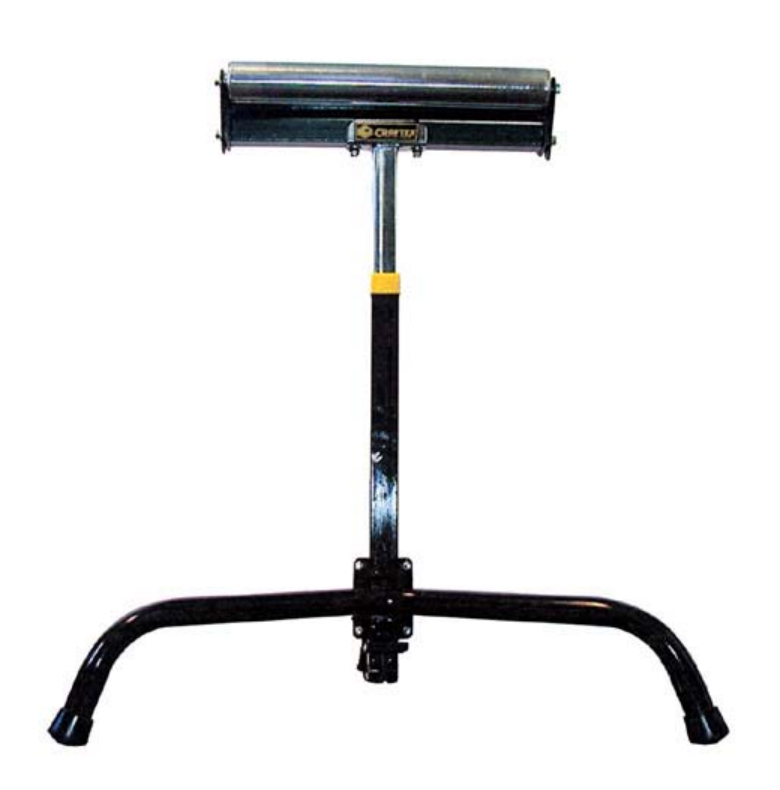
B2435 - Combination Roller/Ball Bearing Stand